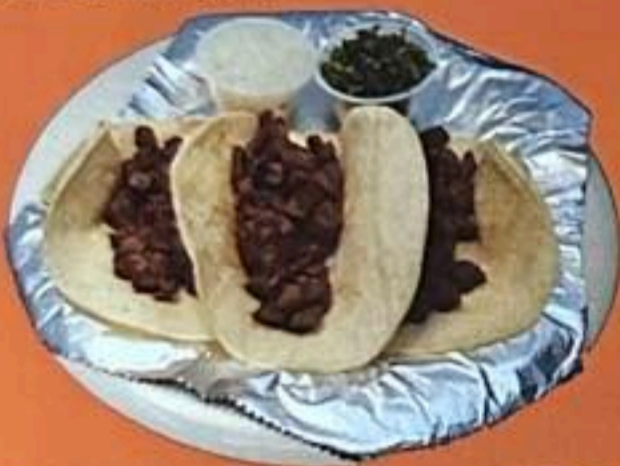
TACOS DE ASADA

All tacos platters served with rice and beans