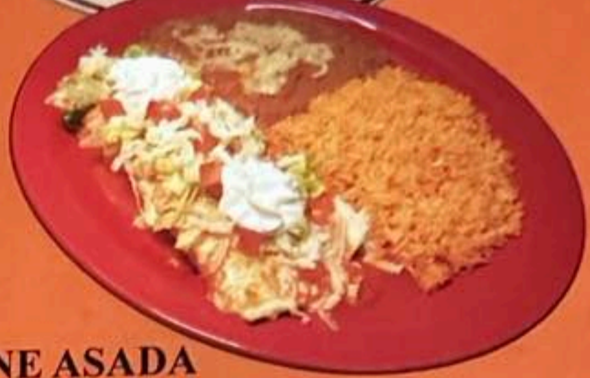
CARNE ASADA BURRITO